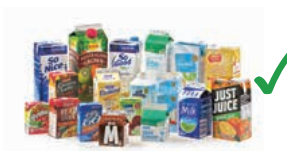
Empty milk and juice cartons

X NO e-waste, batteries, plastic bags, soft plastic, paper towel, tissues, garden waste or clothes