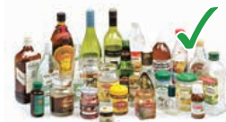
Empty glass and plastic bottles and jars, cans and foil trays