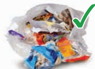
Household garbage and soft plastic packaging