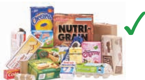
Cardboard boxes, papers, junk mail and magazines