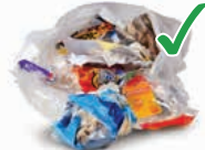
Household garbage and soft plastic packaging