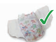
Nappies, sanitary items and animal waste