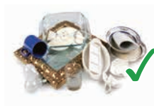
Polystyrene, crockery, Pyrex, rubber and foam

X NO e-waste, batteries, chemicals, paints, oils, solvents or building materials