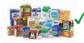
Empty milk and juice cartons

X NO e-waste, batteries, plastic bags, soft plastic, paper towel, tissues, garden waste or clothes