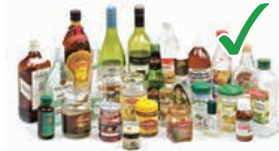
Empty glass and plastic bottles and jars, cans and foil trays