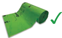
Lime green, certified compostable liners only

X NO plastic bags, plant pots, building materials, animal waste or food packaging