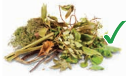
Grass clippings, leaves, weeds, flower and small branches