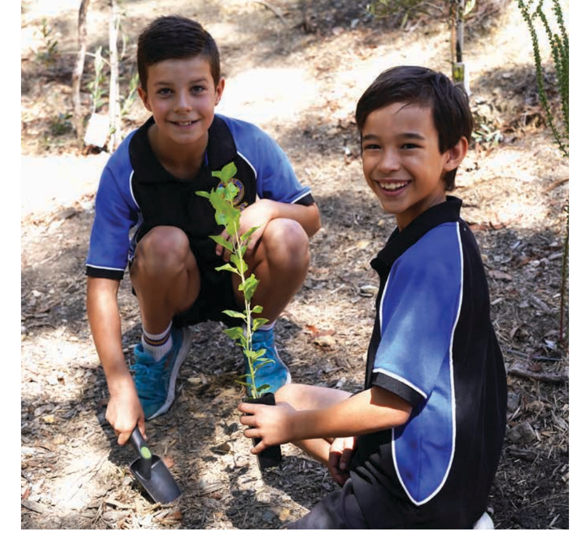
ABOVE: Students from Carey Junior School Donvale who will take part in this year's program.