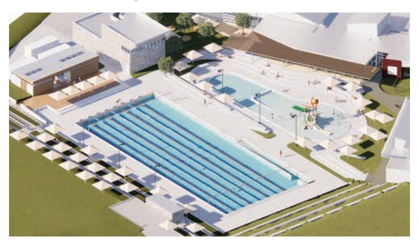
ABOVE: Artist impression of the Aquarena outdoor redevelopment.

We've set out our advocacy priorities across four key themes: Our Commute, Our Environment, Our Safety and Our Wellbeing.