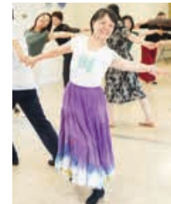
COVER IMAGE: Members of the Seniors Happy Life Club taking part in a ballroom dance lesson.

Manningham Council also values the contribution made to Manningham over the years by people of diverse backgrounds and cultures.