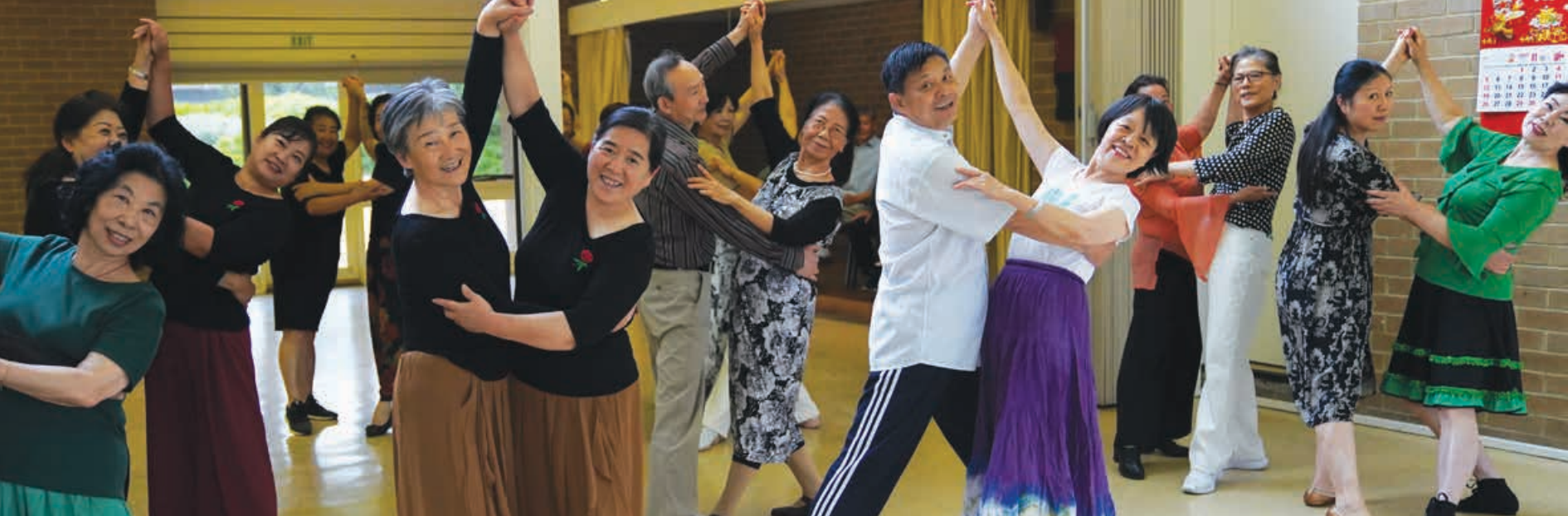
ABOVE: Members of the Seniors Happy Life Club taking part in a ballroom dance lesson.