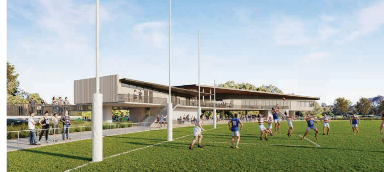
ABOVE: Artist impression of the Bulleen Park redevelopment.

📍 manningham.vic.gov.au/waste-drop-off-day