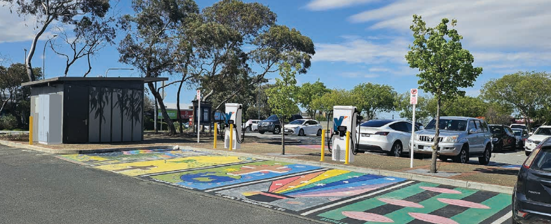
ABOVE: Artist impression of Evie Networks chargers at Tunstall Square.