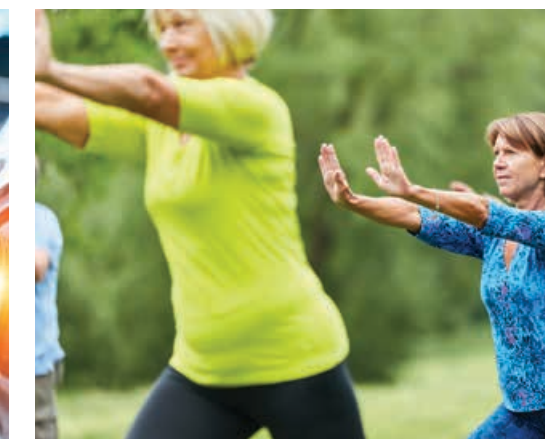
LEFT: Check out the the Electric Vehicle Expo and Seminar. ABOVE: Learn the basics of Tai Chi. RIGHT: Piero Fornasetti, Tema e Variazioni no.130 , 1950s, porcelain wall plate.