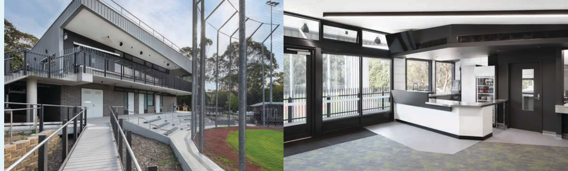
ABOVE: Completed upgrades at Deep Creek Pavilion in Doncaster East.

manningham.vic.gov.au/our-new-stormwater-management-strategy